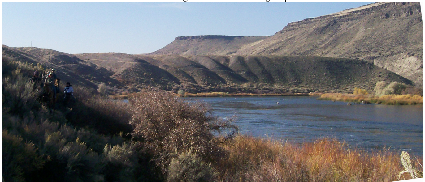
The Snake River Canyon

Please support the local merchants that support SBBCH