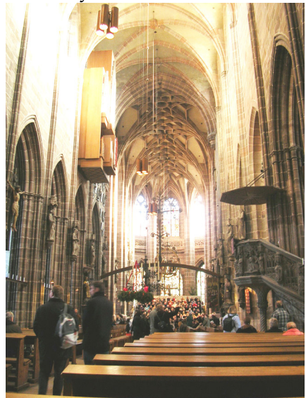
The cathedral was constructed

old Roman city with the new city on top. In a few areas, the fill was deliberate but in most it was natural. I wonder how all the dirt got there. I sure don't feel like my land is rising. In fact it feels like it blowing away most days.