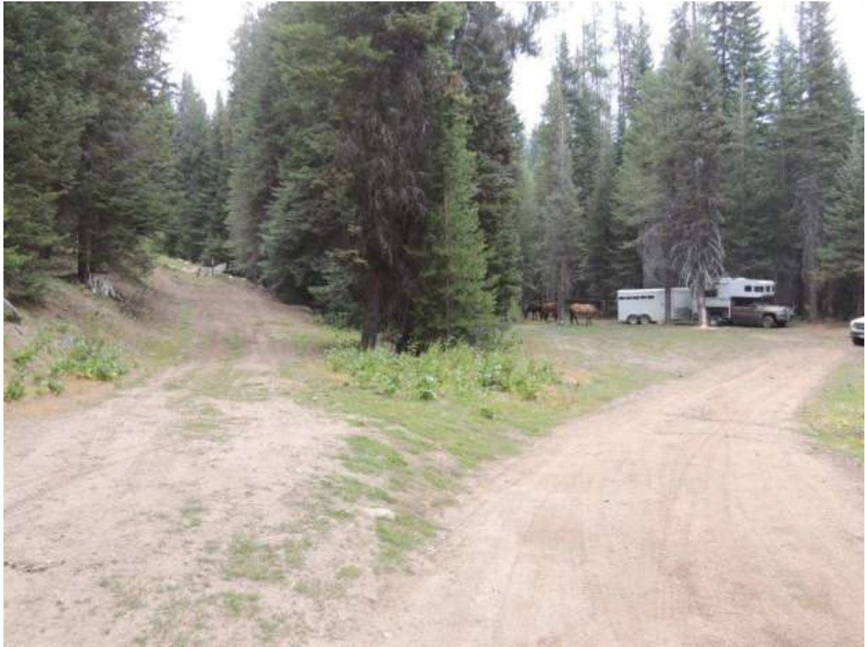
Gabe's peak trail head is the road on the left.