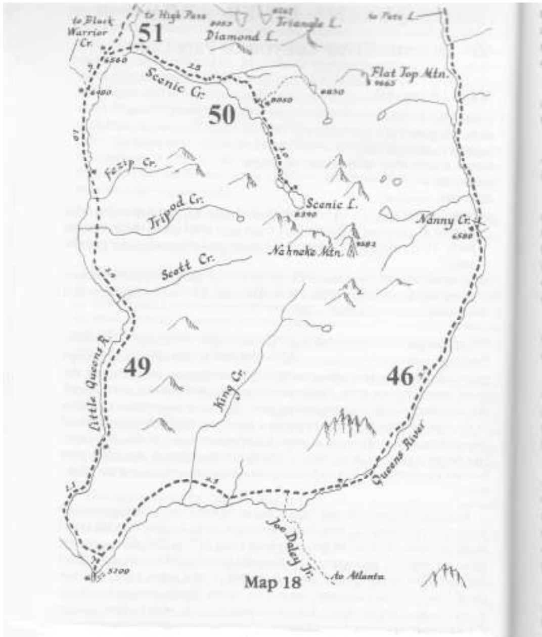
Trails into the Sawtooth Wilderness from the Trail Head