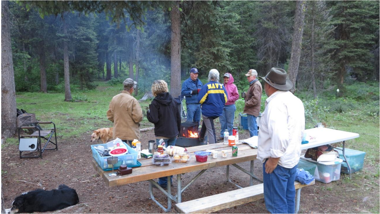
The horse camping area has a fire pit and table.