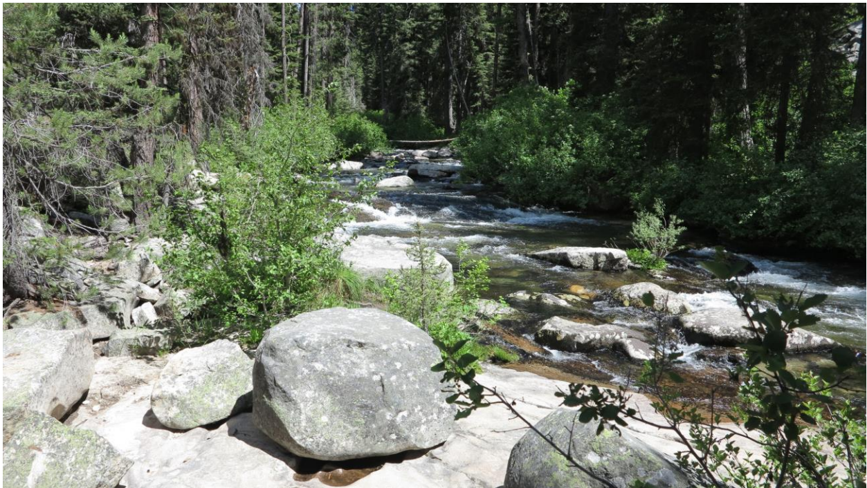
There is good access to water for your stock near the horse camping area at the creek.