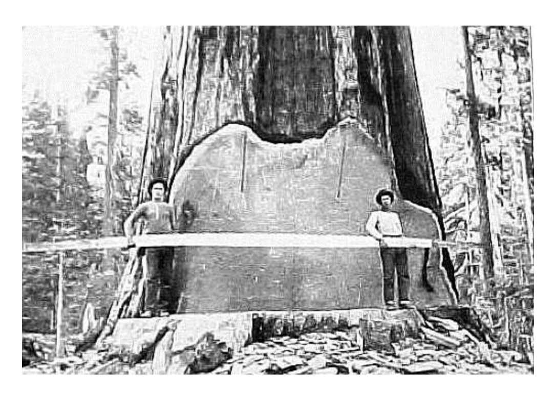
The work required very strong men (and horses) working long days for minimal pay. Could you imagine doing this to earn a living?