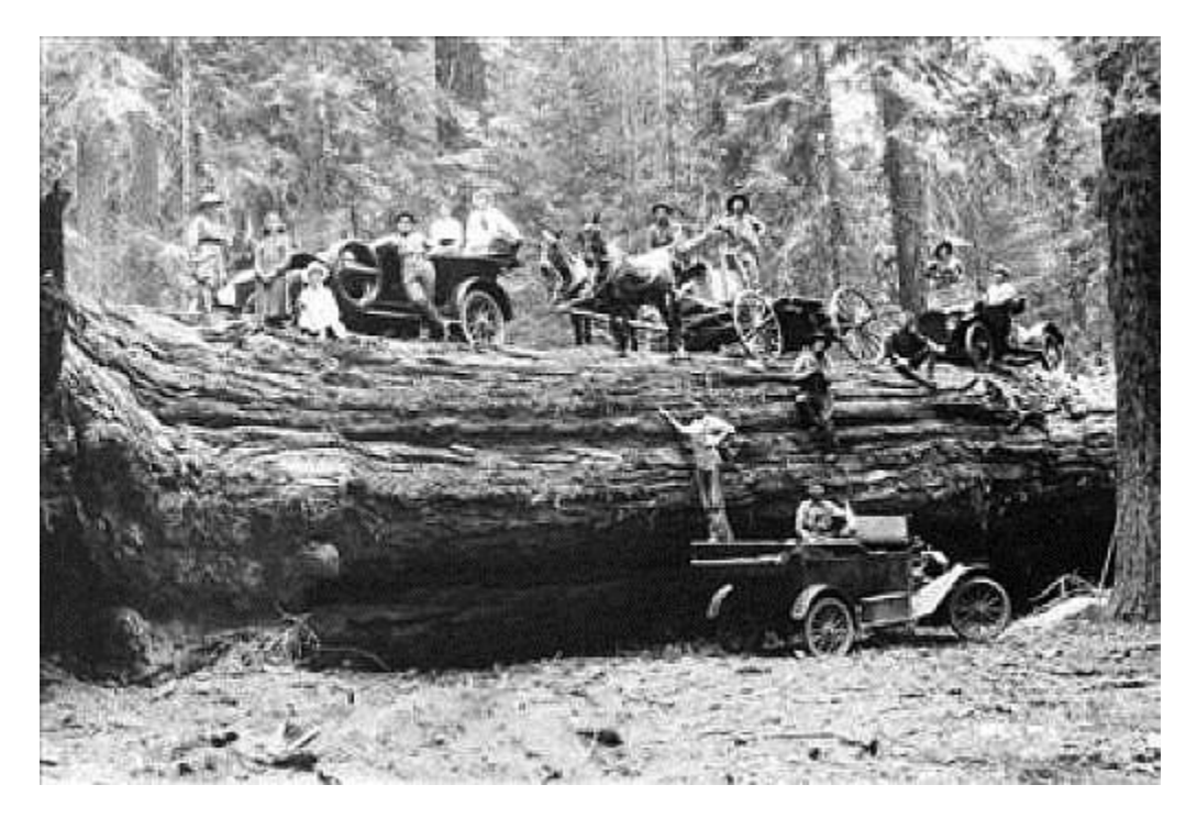
After a tree was finally felled it took a week or more to cut it up into sections that could be managed (somehow) and transported by train to a lumber yard.