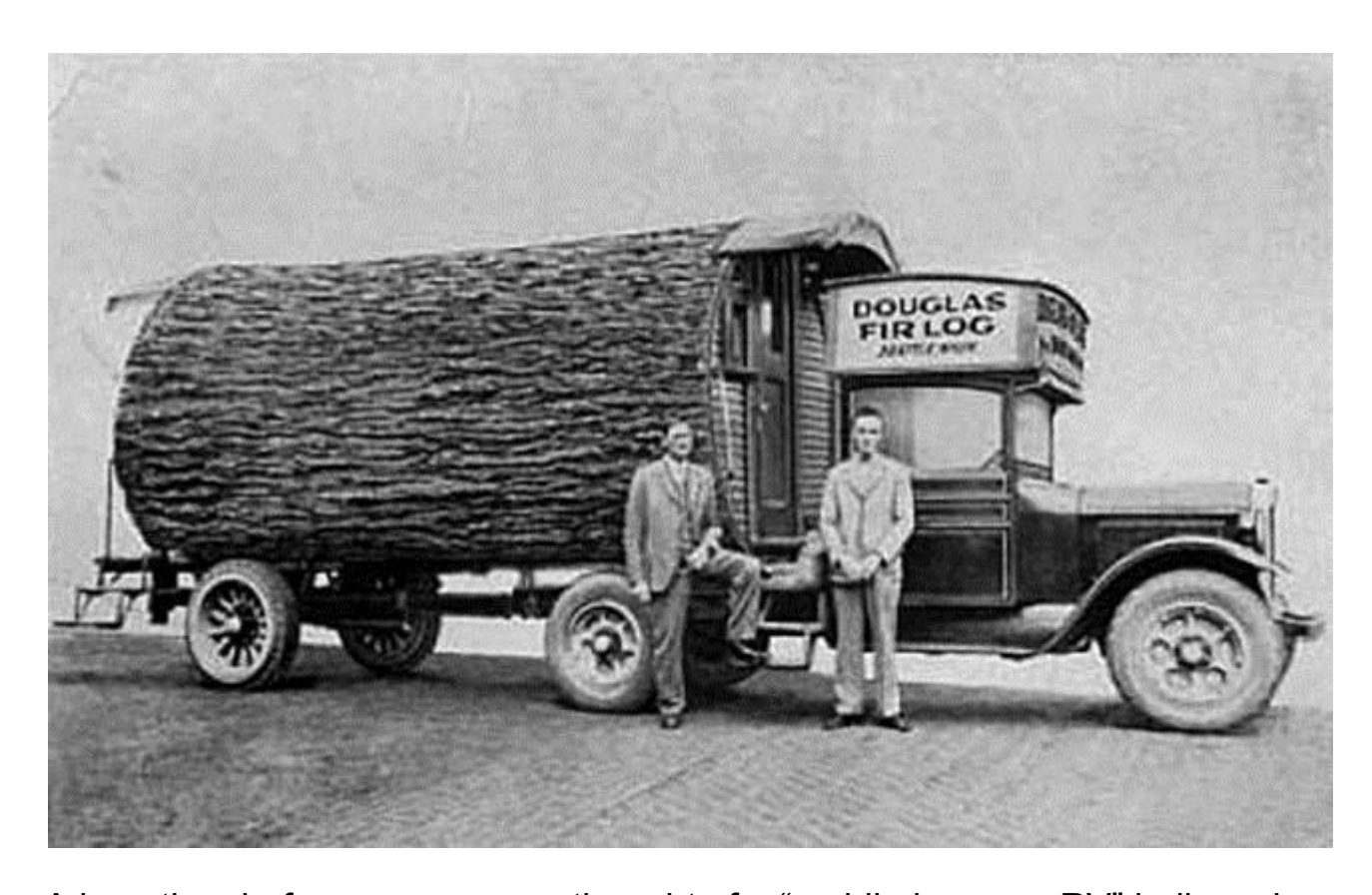
A long time before anyone ever thought of a "mobile home or RV" hollowed out logs were also used to house and feed the logging crews.